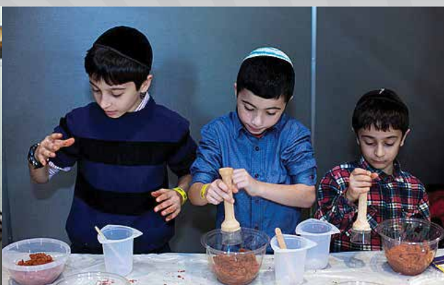
Children learn about the lost art of Damascus through exhibits and crafts