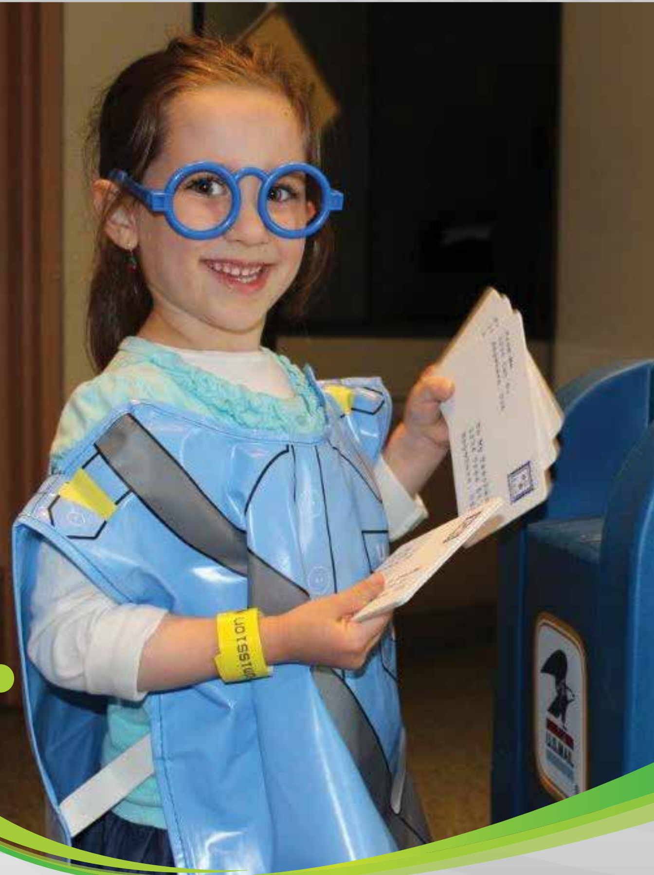
A girl enjoys dressing up and playing the part of a community helper