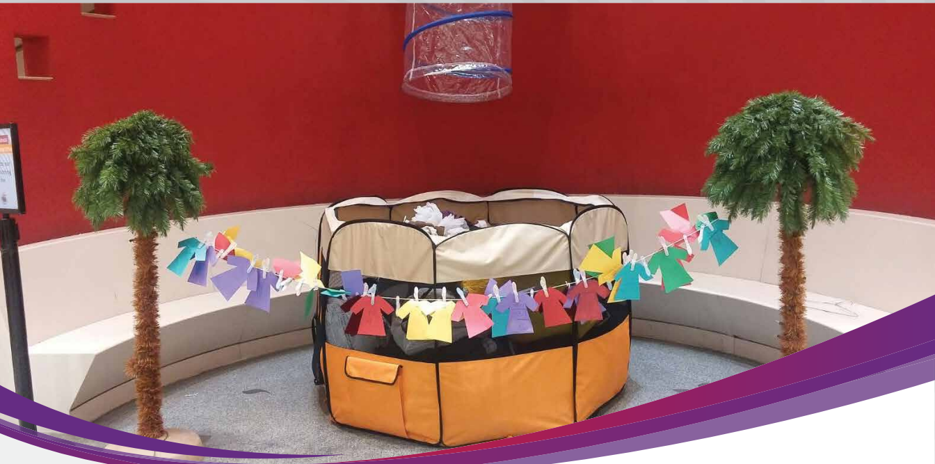
Clothing drive for children