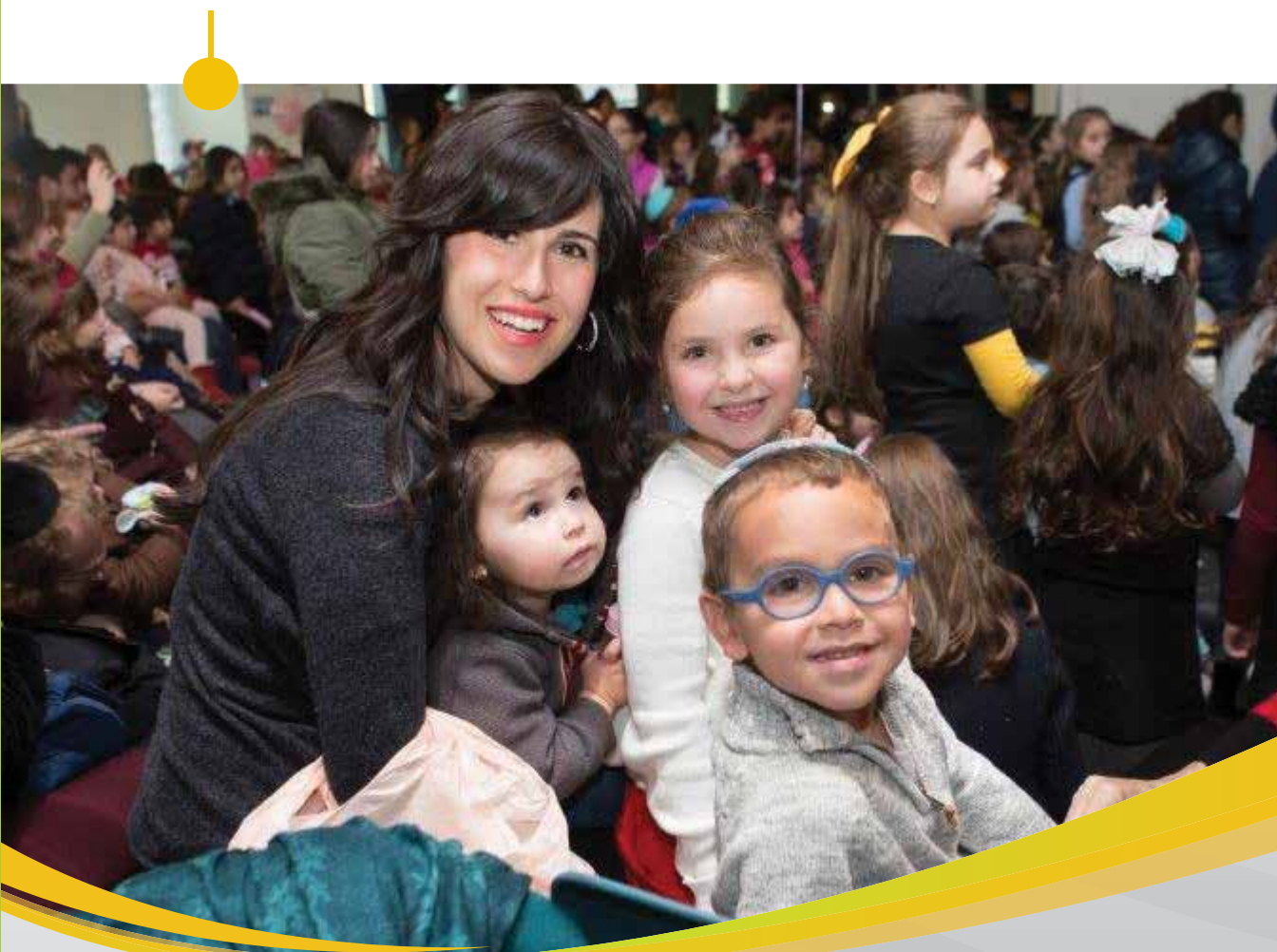
A family enjoying Kosher Day

The Fourth Annual Kosher Day was a spectacular success, bringing together men, women and children from all over the Tri-State area for a day of family fun. With food tastings and samples from tens of Kosher food companies, an interactive Chocolate Factory for children to enjoy, and Uncle Moishy performances, a great time was had by all. The day also featured face painting, photo booths, rock climbing and balloon sculptures.